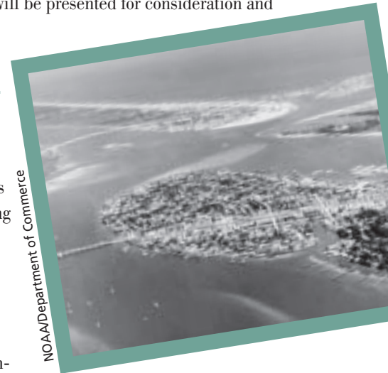
NOAA Department of Commerce

and conflicts. These conflicts include an increase in the number of enclaves and failure to annex those enclaves, loss of revenue for counties, less effective service delivery, avoidance of more restrictive land use plans or county regulations, and cities' objections to urban