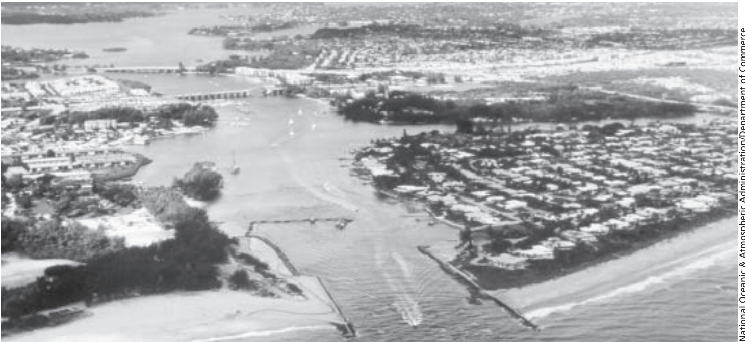
National Oceanic & Atmospheric Administration/Department of Commerce