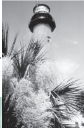
American Heritage Rivers Initiative

In conjunction with proposed policy changes, 1000 Friends remains committed to upholding citizen participation in the planning process. We firmly believe that in conjunction with any policy changes, citizens must have a strong voice on projects that impact them, are clearly advised of potential impacts of land use decisions, have a quick, easy and fair appeals process, receive protection from developers’ lawsuits and achieve lawyer-free conflict resolution for all land use disputes. ■