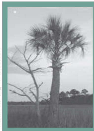
American Heritage Rivers Initiative