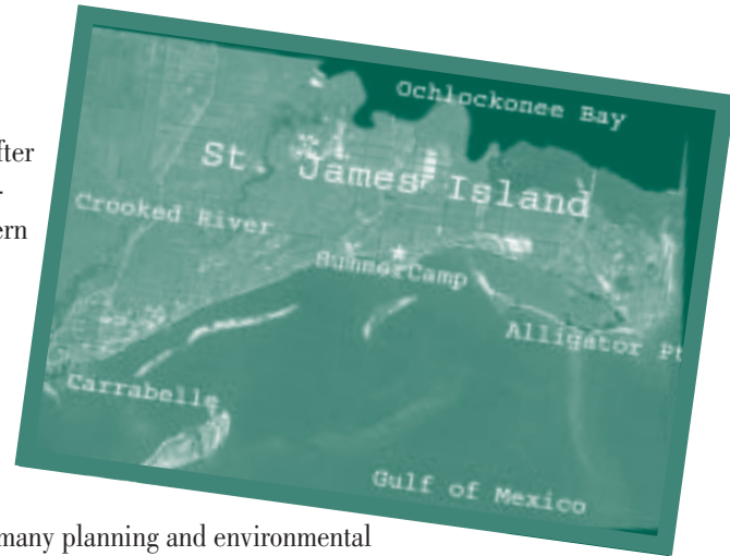
St. Joe's proposed SummerCamp community is to be located in the Florida Panhandle.

1000 Friends' work on this and other projects in the Florida Panhandle is made possible through the generous support of the Doris Duke Charitable Foundation. ■